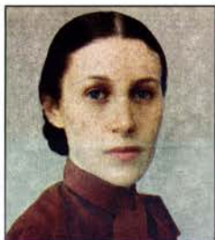
"Dress," 2005, 20" x 24"

PLUS ... HIGH HOPES FOR A PATS SUPER BOWL WIN