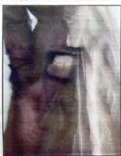
"Dressing," 2005, 20" x 40"